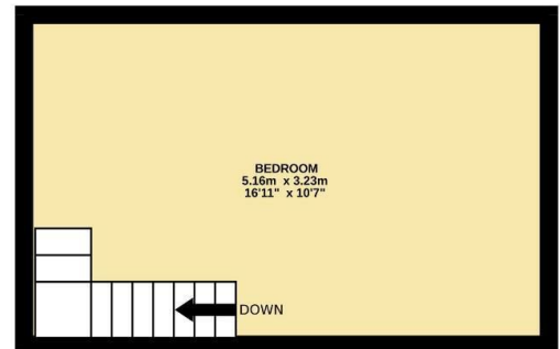
1ST FLOOR 16.7 sq.m. (180 sq.ft.) approx.